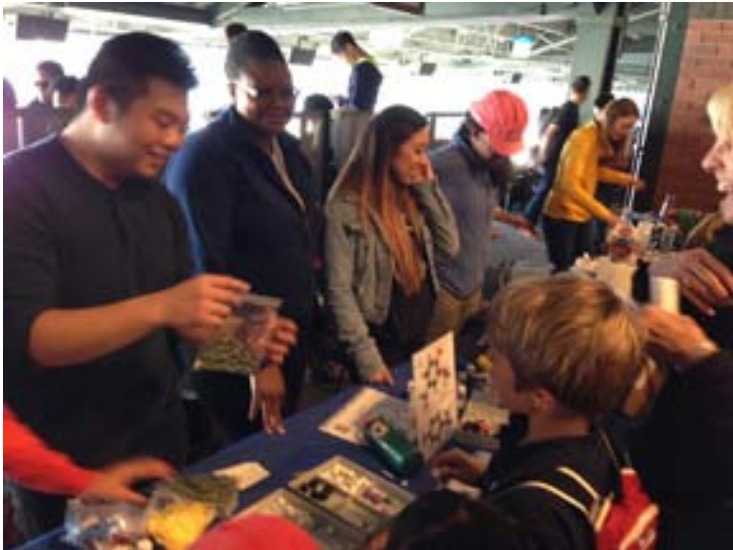
Some of the visitors to the CalACS booth for the Bay Area Science Festival Discovery Days event at AT&T Park on November 7.