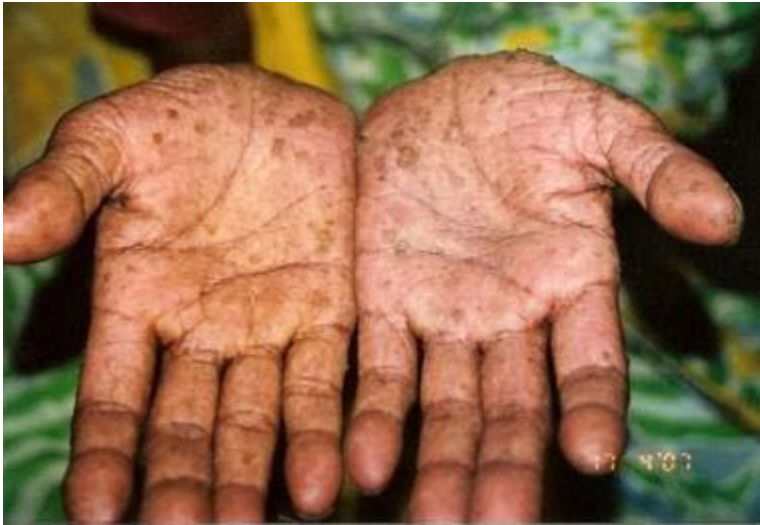
Figure 2: Skin lesions caused by chronic arsenic exposure from drinking water.