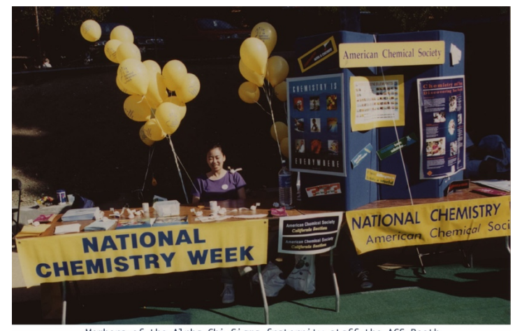
Members of the Alpha Chi Sigma fraternity staff the ACS Booth at the Funzone, 13 November 1999, University of California, Berkeley Memorial Stadium

NCW '99 (Nov. 7-13) has been a MOST EXCITING week for the California Section! Not only have we had various public outreach efforts conducted by members throughout our local section, but this year our NCW efforts included TWO HUGE NCW EVENTS. As a "brand-new" NCW event, the California Section was thrilled to appear as part of the half-time show at the CAL football stadium on the campus of UC Berkeley before an estimated crowd of 50,000 with an NCW-SEABORG TRIBUTE on Nov. 13. Earlier on Nov. 9, we celebrated NCW '99 with our third and everpopular Family Science Night program, this year featured as "Y2CHEM - A CHEMISTRY EXTRAVAGANZA" in Piedmont, California. IChC, the International Chemistry Celebration, which began with NCW last year and concluded with NCW this year, was celebrated at both of the California Section NCW'99 events. A mission common to both NCW and IChC is to "enhance the public appreciation of chemistry and its contributions to everyday life."