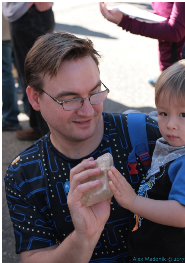
"The magic of Calcite."