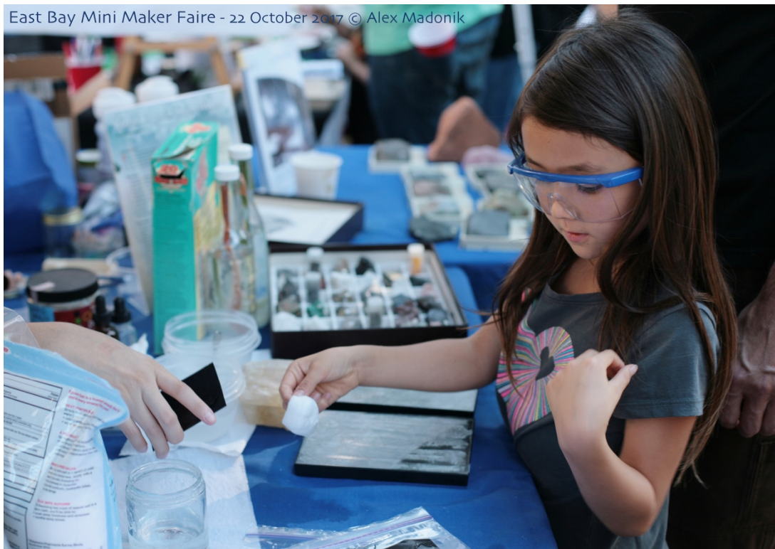
"Preparing to grow Epsom Salts crystals."

East Bay Mini Maker Faire - 22 October 2017