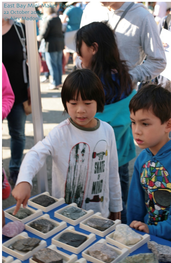
"Rose Quartz was a favorite among our many visitors."