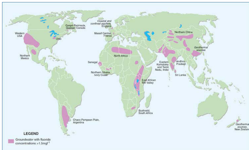
Figure 1: Known fluoride belts with groundwater exceeding 1.5 mg/L.