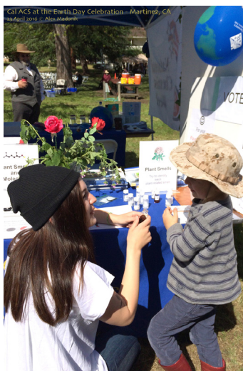
Smell of Plants

Perfect mild temperatures on a sunny day made the event very popular and gave us the opportunity to reach out to the public with eco-friendly chemistry activities. Our section engaged children, adults of all ages, teachers and other professionals. The participation by the CalACS section in the event continues to build a positive image of chemistry and of science in general.