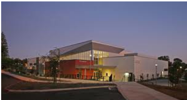
Butte College Oroville CA