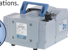
VACUUBRAND® MZ2C NT