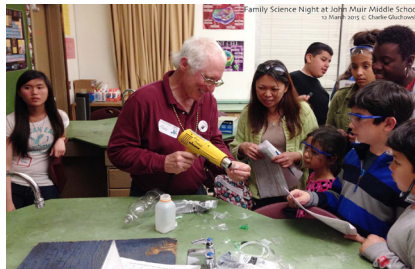
Family Science Night at John Muir Middle School © March 2015

Arroyo High School volunteers were busy in several classrooms, and they took charge of Plant Scents and Molecular Models in room D10, challenging visitors to identify