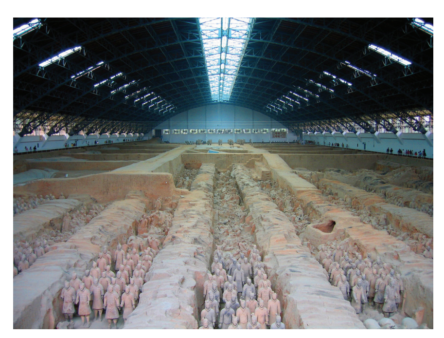
The Color Purple, Xian's Terracotta Warriors. See page 6