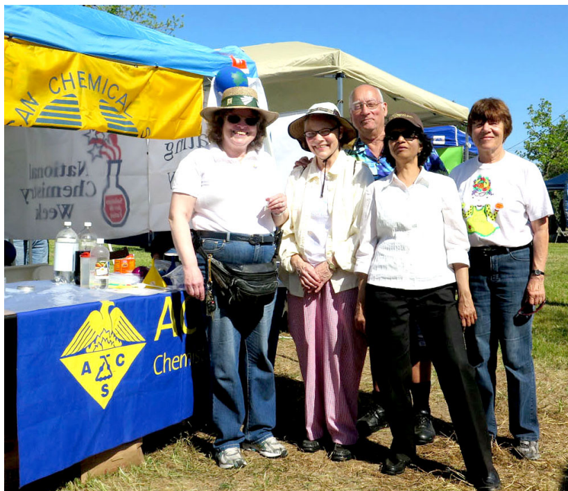
Members of The California Section of ACS