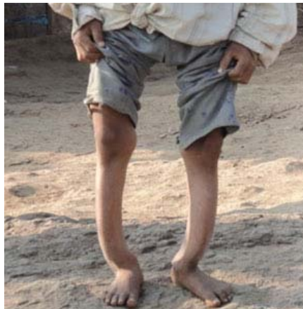
Figure 2: Photo of skeletal fluorosis in India.