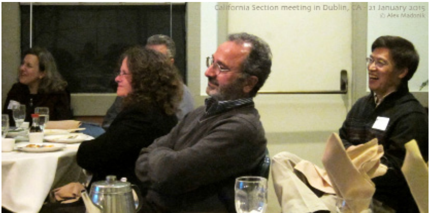
California Section meeting in Dublin, CA - 21 January 2015