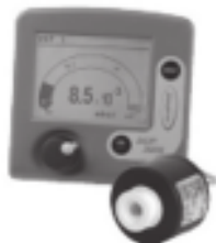
DCP 3000 + VSP 3000 vacuum gauge