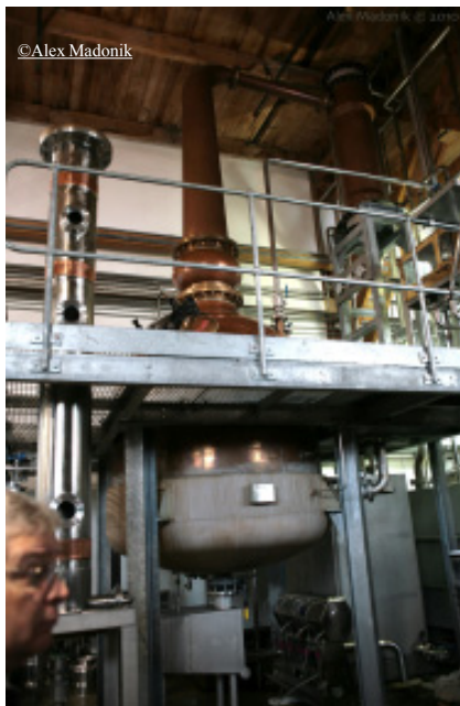
The hand-built copper still at Distillery 209 is modeled on one used in Scotland.