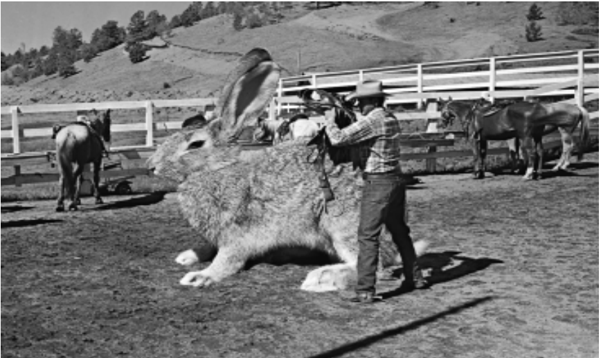
Ranchers finding some benefit to GMO fed animals.*